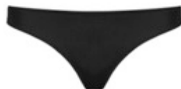
3. KRISTY– PINK PARADISE

Style: Pink Paradise Sizes: XS, S, M, L, XL Colour: Pink, pink mesh, black Avail: Jan, 2016 Wholesale: $56.82 (ex VAT) RRP: $125