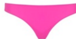
2. KRISTY– CLOUD NINE

Style: Cloud Nine Sizes: XS, S, M, L, XL Colour: White, black mesh Avail: Jan, 2016 Wholesale: $56.82 (ex VAT) RRP: $125