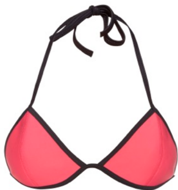
1. MIRANDA – BLUSH

Style: Blush Sizes: XS, S, M, L, XL Colour: Strawberry Avail: Jan, 2016 Wholesale: $20.45 (ex VAT) RRP: $45