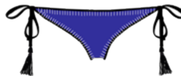
6. JESSICA – NAUTICA

Style: Nautica Sizes: XS, S, M, L, XL Colour: Navy, white crochet Avail: Jan, 2016 Wholesale: $68.18 (ex VAT) RRP: $150