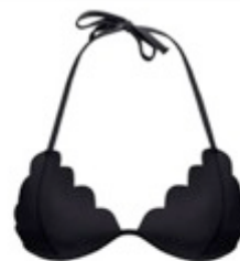
5. GEMMA – BLUE BAY

Style: The Deep Sizes: XS, S, M, L, XL Colour: Black Avail: Jan, 2016 Wholesale: $56.82 (ex VAT) RRP: $125