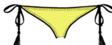
8. JESSICA – SAND DRIFT

Style: Sand Drift Sizes: XS, S, M, L, XL Colour: Lemon, black, white crochet Avail: Jan, 2016 Wholesale: $68.18 (ex VAT) RRP: $150