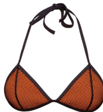
2. MIRANDA – ORANGE CRUSH

Description: 100% neoprene triangle halter top.