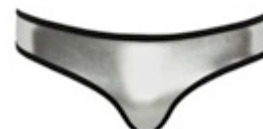
4. SAMANTHA – MOONBEAM

Style: Moonbeam Sizes: XS, S, M, L, XL Colour: Silver Avail: Jan, 2016 Wholesale: $56.82 (ex VAT) RRP: $125