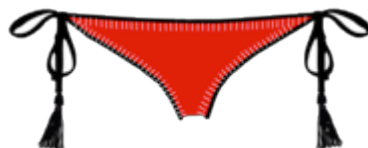
7. JESSICA – STARFISH

Style: Starfish Sizes: XS, S, M, L, XL Colour: Red, white black crochet Avail: Jan, 2016 Wholesale: $68.18 (ex VAT) RRP: $150