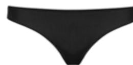
4. KRISTY – OCEAN NIGHTS

Style: Ocean Nights Sizes: XS, S, M, L, XL Colour: Aqua, aqua mesh, black leatherlook Avail: Jan, 2016 Wholesale: $56.82 (ex VAT) RRP: $125