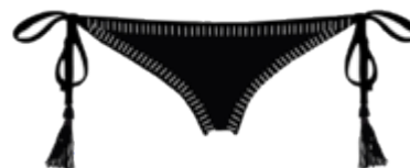
10. JESSICA – SCORCHER

Style: Scorcher Sizes: XS, S, M, L, XL Colour: Strawberry, black, white crochet Avail: Jan, 2016 Wholesale: $68.18 (ex VAT) RRP: $150