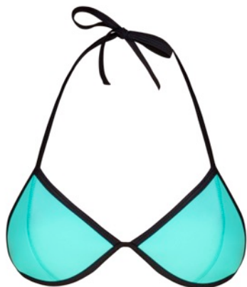
3. MIRANDA – OASIS

Description: 100% neoprene triangle halter top