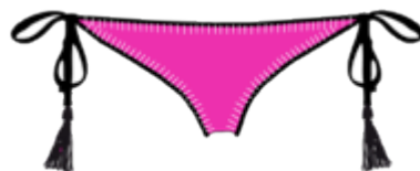
5. JESSICA – ICE CREAM

Style: Ice Cream Sizes: XS, S, M, L, XL Colour: White, rose pink, white crochet Avail: Jan, 2016 Wholesale: $68.18 (ex VAT) RRP: $150